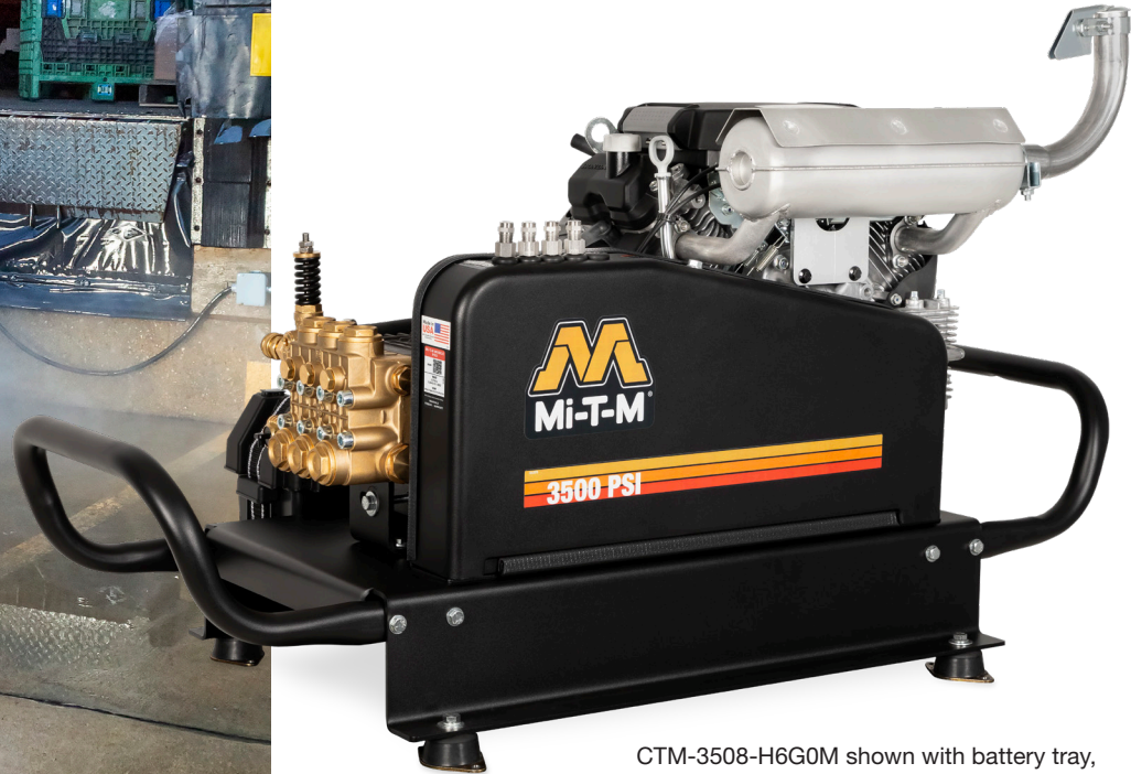
CTM-3508-H6G0M shown with battery tray, box and 2-foot of cables option, CX-0128

This cold-water truck-mount series is designed for mobile cleaning. Mount it to a truck or trailer with a water tank and clean anywhere, anytime. It's ideal for industrial cleaning and remote locations.