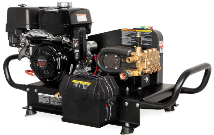
CTM-3005-H6G0M shown with electric start option, CX-0127 and battery tray, box and 2-foot of cables option, CX-0128